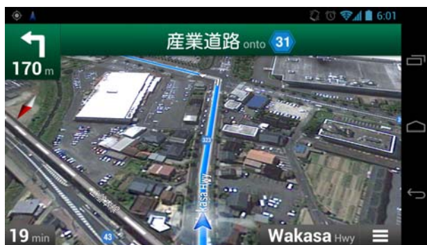
Fig. 3 Google Maps navigation

Recently, navigation system using mobile device is very popular technology [10][11]. A lot of people use that system on smartphone with that technology. Needless to explain, when a user goes another place without information of that area, he/she often uses navigation system. The system makes to guide a person who doesn't know information of that area. The system is used on driving with a high frequency. Therefore there are many functions on that system such several methods to input data. For example, a user could input to use map on touch display. Needless to say, he/she also could input destination name by text on virtual keyboard. And the important thing to remember is a driver cannot input data with his/her hand, and cannot look display so every time. For this reason, almost systems have voice input. It is assiduities for driver's safety.