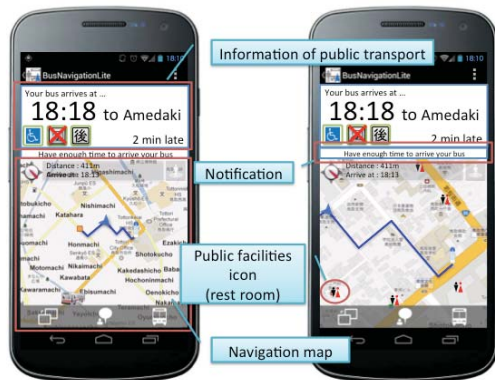
Fig. 5 Navigation on walking state

same as the existing navigation systems. However,