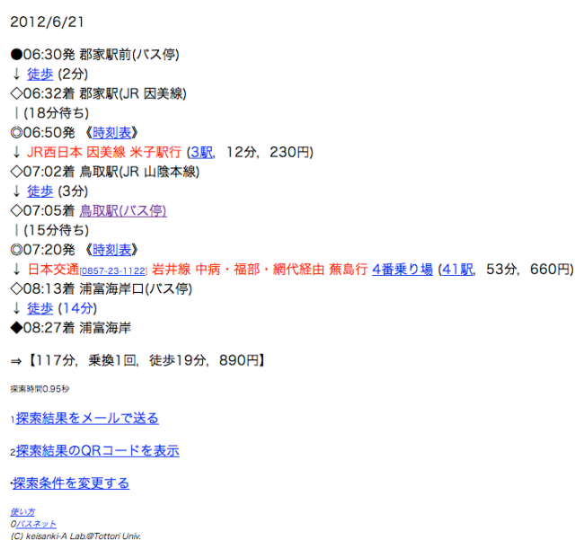
Fig. 2 Result of searching path using "Bus-Net"

Recently, many systems to provide information for public transport are developed and released [4][5]. Some systems provide a path to go destination. Fig.2 shows the result of path planning on our system called "Bus-Net"[6][7]. It shows how to go to "Uradome coast" from "Koge station". It is difficult to understand such information since it contains too much information.