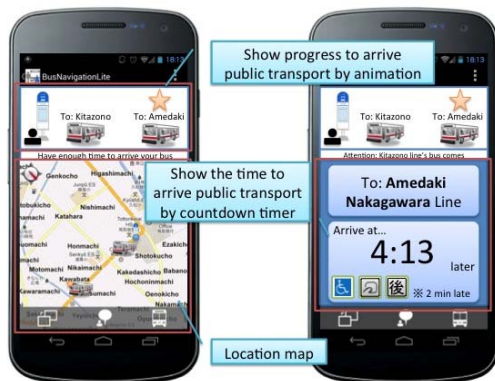
Fig. 6 Navigation on waiting state

On the waiting state at the bus stop or the station, a passenger is not just waiting with doing nothing. At first, if he/she takes a train, he/she must buy a ticket before riding the train. Secondly, he/she must go to the platform to ride a train. In addition, if he/she wants to drink something, he/she might go to the vending machine. Our system shows a map of the station, location of a vending machine or a store around the user, and countdown the departure time of the train. Figure 6 illustrates a user interface for the waiting state.