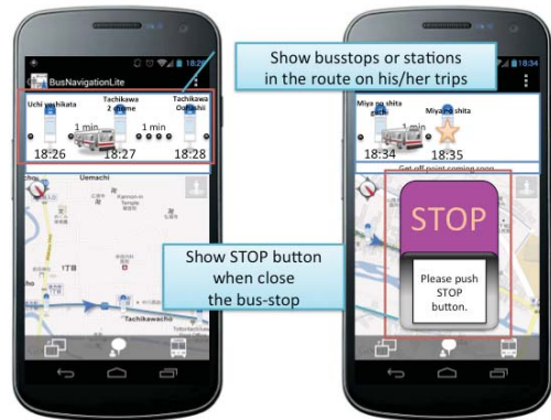
Fig. 7 Navigation on riding state

at the destination, the system alerts the user to get off. If he/she must transfer another transportation at that point, the system shows the way to move to the next point and information of the next transport. Figure 7 illustrates a user interface for the riding state.